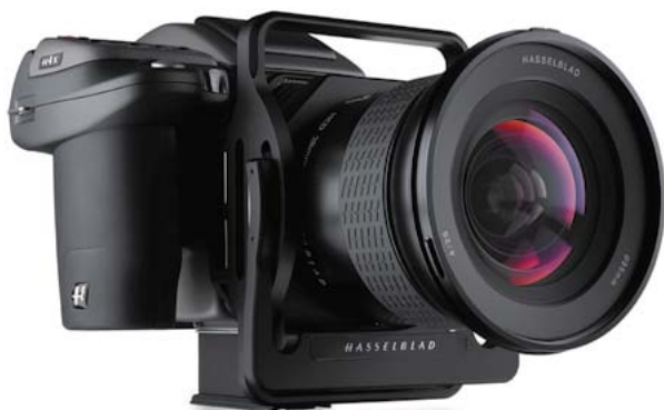
HTS 1.5 tilt/shift adapter and a HCD 28mm lens.

The grip LCD and the viewfinder LCD is of dot-matrix type. This means that the camera is able to present clear and easy-to-understand information and messages instead of fixed and sometimes not so obvious symbols.