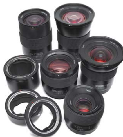
5 HC/HCD lenses including Extension Tubes can be used with the HTS 1.5