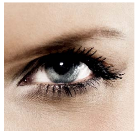
The middle image shows the result when not using True Focus. While this image looks relatively sharp, the rightmost image where True Focus has been used, is razor sharp.