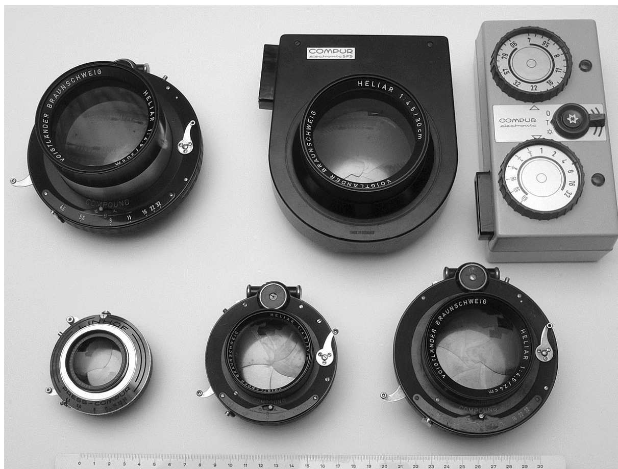
Fig. 2: Heliar lenses. Back row from left to right: 300mm f/4.5 Heliar in a Compound V, 300mm f/4.5 Heliar in a Compur 5FS with control box. Front row from left to right: 150mm f/4.5 Heliar in a Synchro-Compur 1, 210mm f/4.5 Heliar in a Compound III, 240mm f/4.5 Heliar in a Compound IV. Scale is in cm.