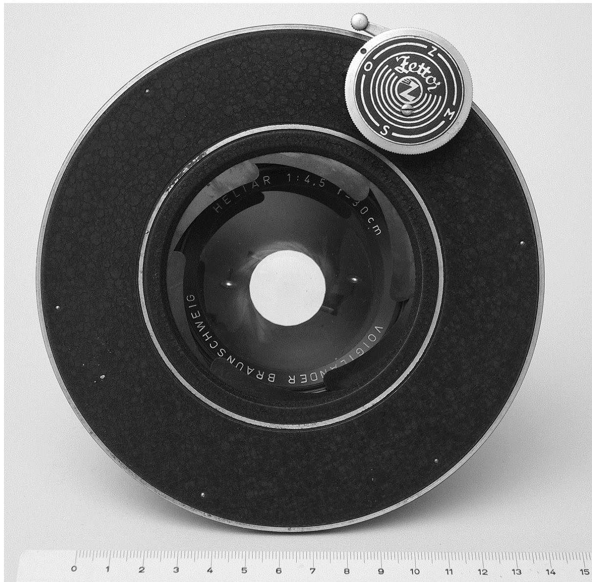
Fig. 3: Heliar 300mm f/4.5 with front-mounted Zettor shutter. Scale is in cm.