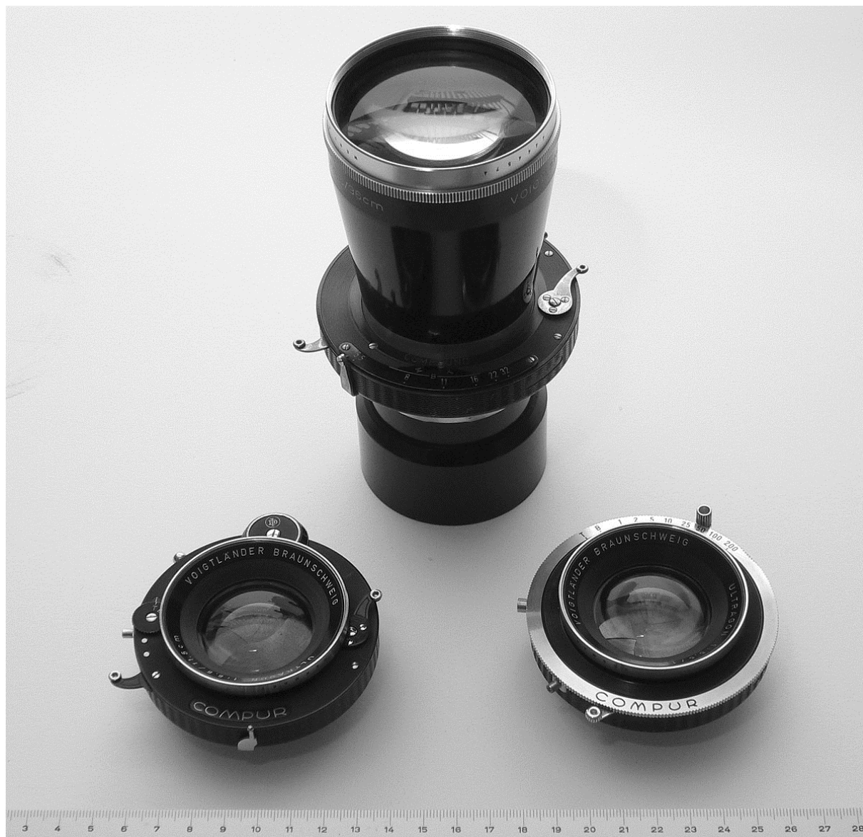
Fig. 5 : back, 360mm f/5.5 Telomar in a Compound III. Front row left: 115mm f/5.5 Ultragon in a dial-set Compur 2, right: 115mm f/5.5 Ultragon in a rim-set Compur 2. Scale is in cm.