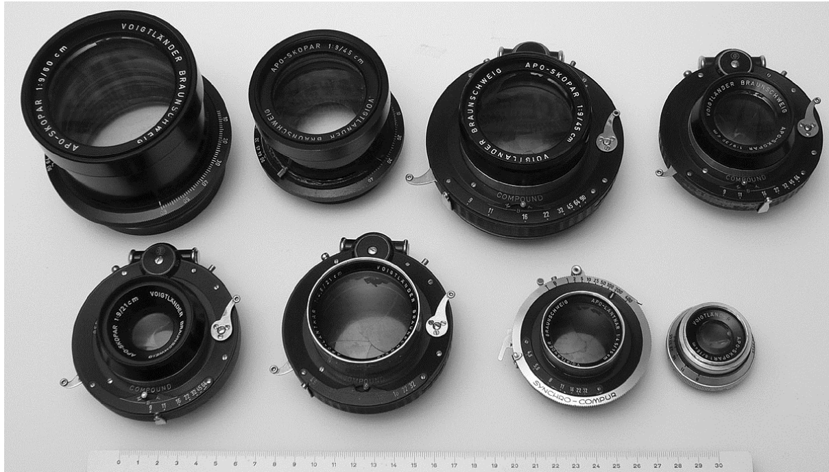
Fig. 4: Apo-Lanthar and Apo-Skopar lenses. Back row from left to right: 600mm f/9 Apo-Skopar in barrel, 450mm f/9 Apo-Skopar in barrel, 450mm f/9 Apo-Skopar in a Compound IV, 300mm f/9 Apo-Skopar in a Compound III. Front row from left to right: 210mm f/9 Apo-Skopar in a Compound III, 210mm f/4.5 Apo-Lanthar in a Compound III, 150mm f/4.5 Apo-Lanthar in a Synchro-Compur 1, 150mm f/8 Apo-Skopar in barrel. Scale is in cm.