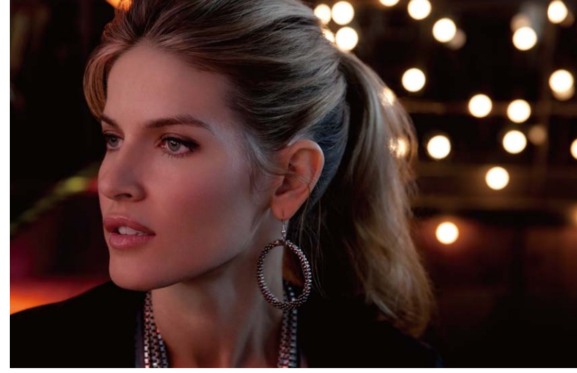
Focal length: 70mm Exposure: F/5.6 1/15 sec ISO400