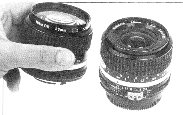
35mm f/2.8 Nikkor is just a hair larger, heavier than one f/stop smaller f/1.4 Nikkor.