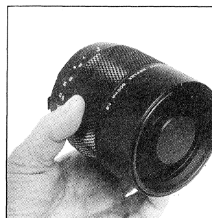
Ultra compact hand-holdable 500mm f/8 mirror lens