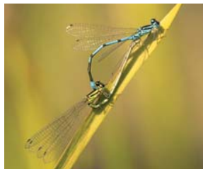
with ZUIKO DIGITAL ED 50-200mm 1:2.8-3.5