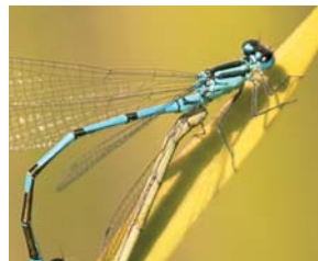
with ZUIKO DIGITAL ED 50-200mm 1:2.8-3.5 and EC-20