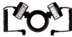
TF-22 Twin Flash compatible with selected lenses (see Olympus website for details)