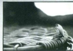
Macro focus at 1/4 life size