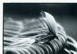
Macro focus at 1/2 life size

■ Fastest 70-210mm available on the market today. Revolutionary new Vivitar design allows f2.8 aperture for optimum performance with slower transparency film.